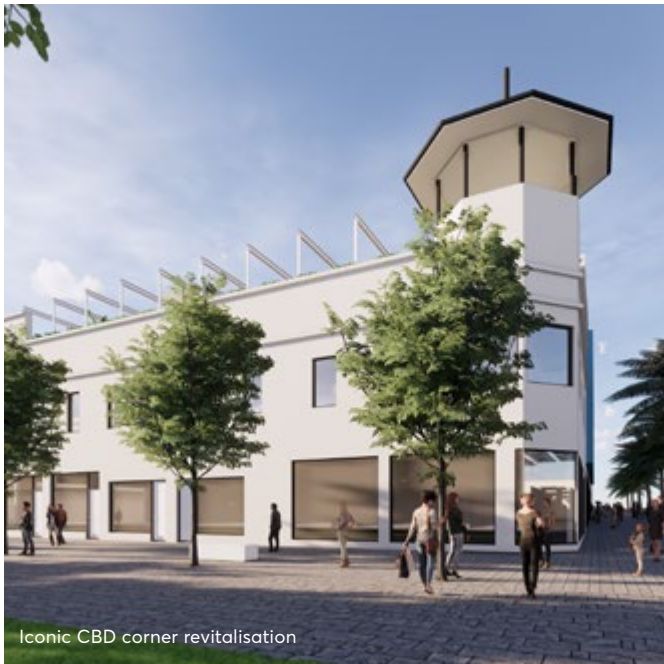
Iconic CBD corner revitalisation