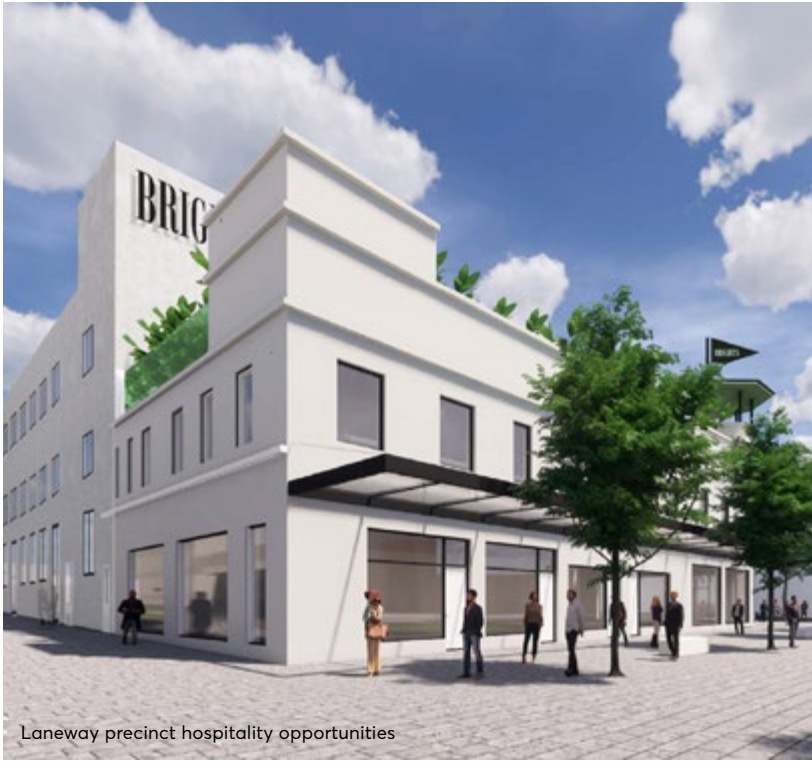
Laneway precinct hospitality opportunities