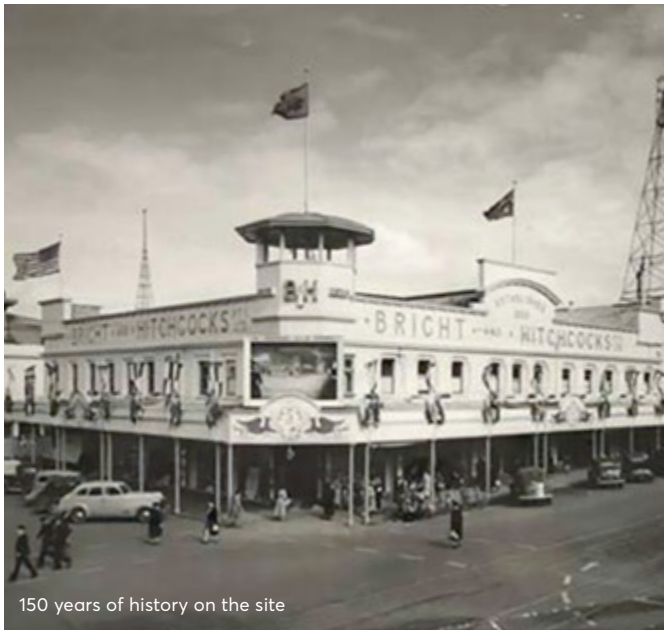
150 years of history on the site