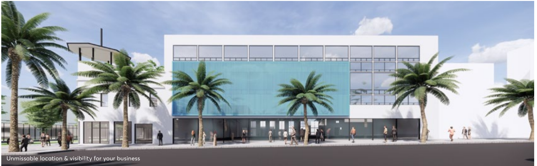
Unmissable location & visibility for your business