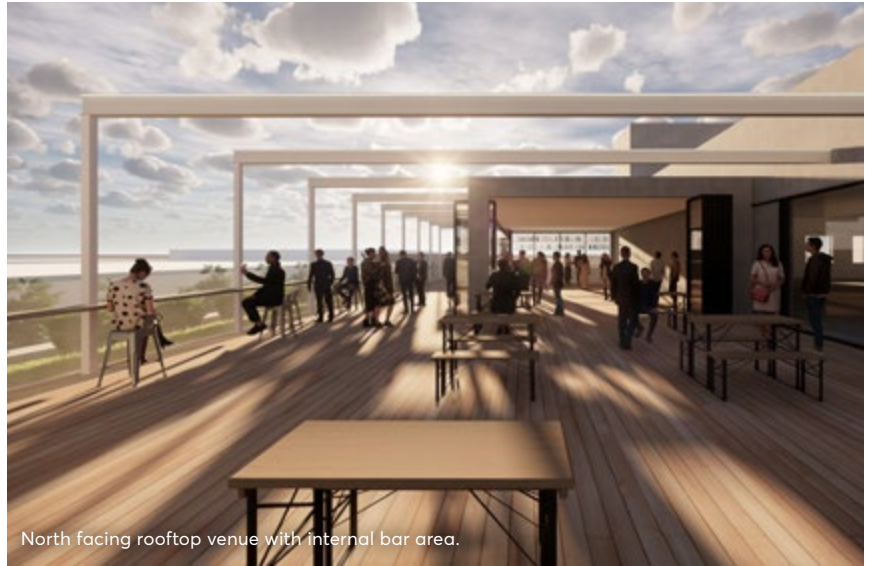
North facing rooftop venue with internal bar area.