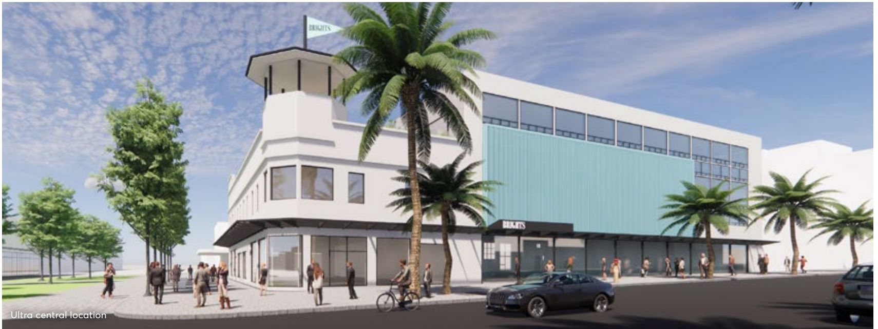
Ultra central location