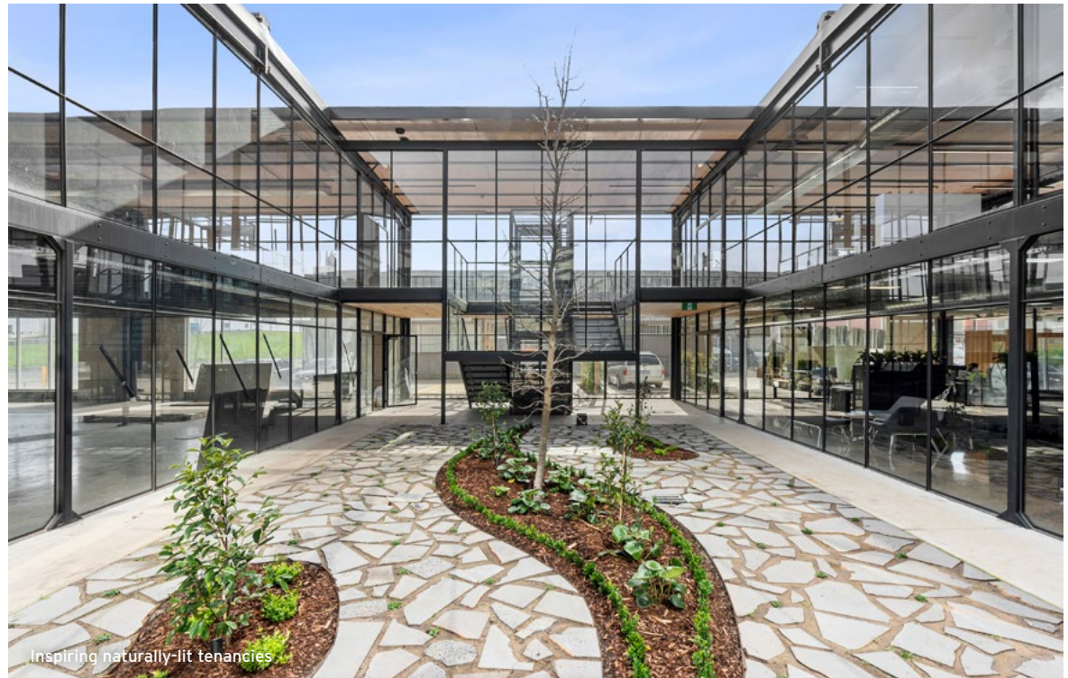
Inspiring naturally-lit tenancies