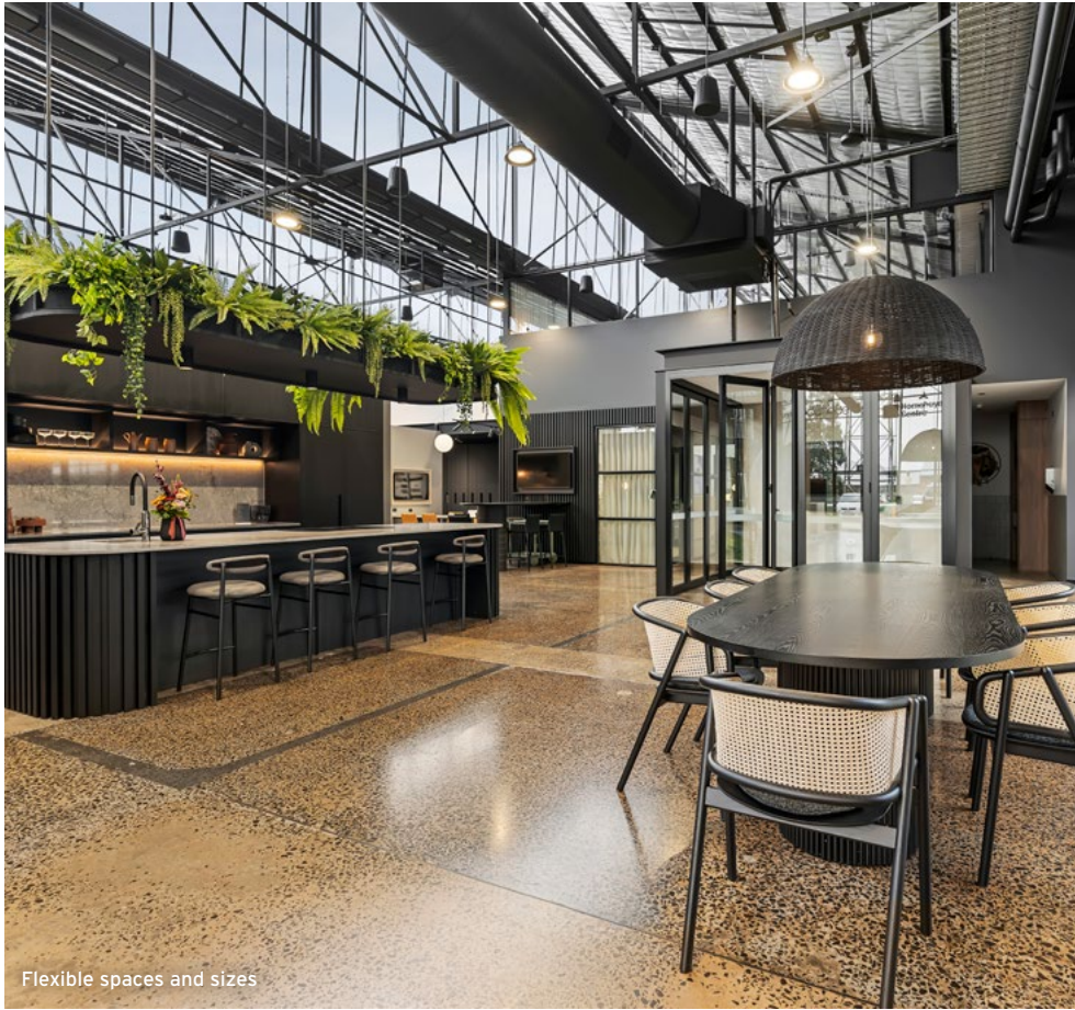
Flexible spaces and sizes