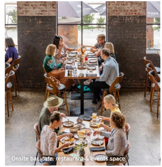
Onsite bar, cafe, restaurant & events space