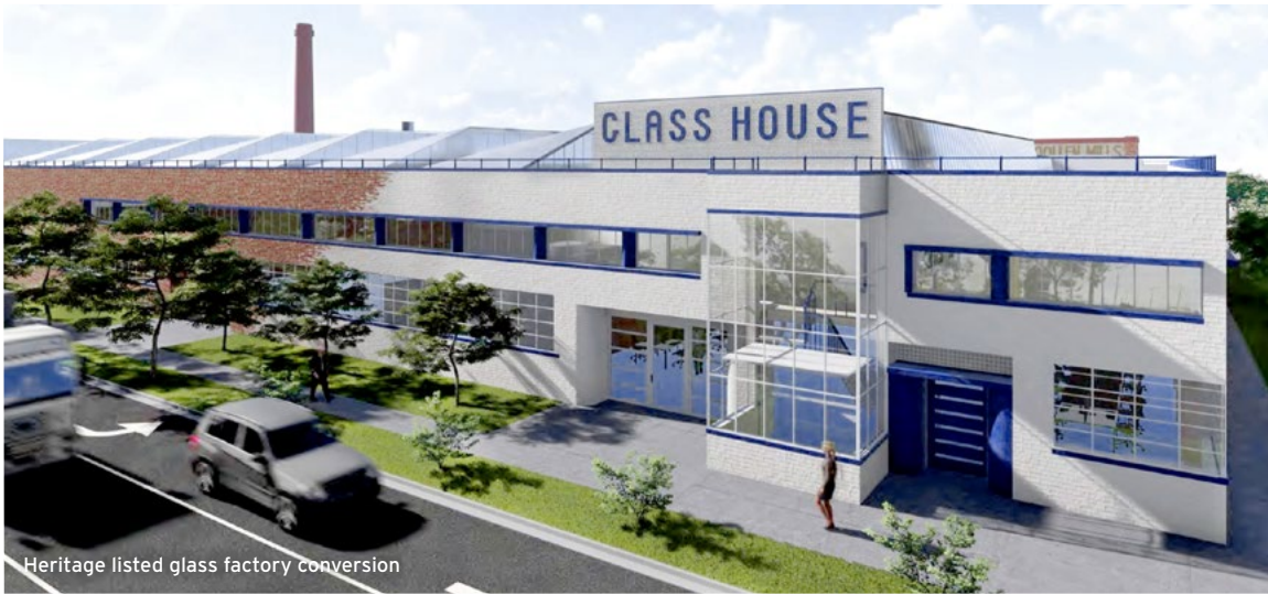
Heritage listed glass factory conversion